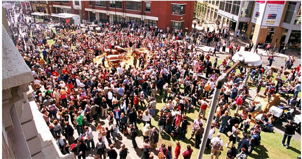
Figure 3. Founded by Peter Murray, the London Festival of Architecture is a celebratory event organised in London during a short period in summer. It started in 2004 and based around Clerkenwell, London. It started as a biennale festival till 2012 and then became an annual event in the City of London since then. The very first event as shown in this figure lasted ten days and included many lectures and talks from well-known architects, such as Zaha Hadid, Peter Ackroyd, and Dejan Sudjic. The event was oriented around the main topic of “Gentrification v Regeneration”, which was also marked as an important era for the Clerkenwell area. It soon became a major attraction event that made regeneration more visible.

the survey as well as the mode of development that has taken place in Clerkenwell in recent decades ( Figure 3 ).